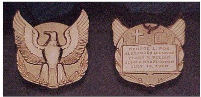
Presented posthumously to the Four Chaplains